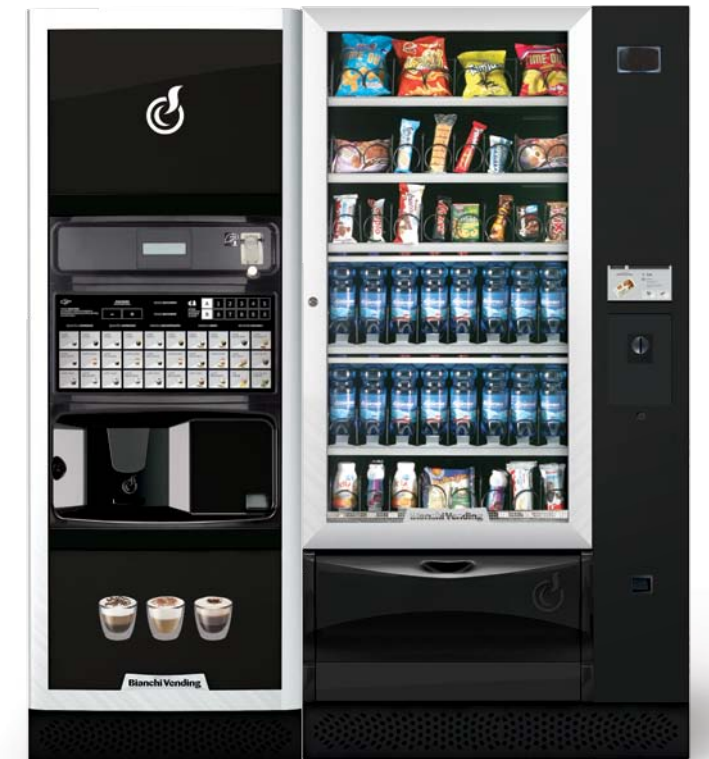
LEI700 PLUS + VISTA L MASTER TOUCH 7"

HIGH QUALITY VIDEO. The LCD technology used in our monitors will accommodate high quality images and promotional or information videos, drawing the user even more powerfully into the consumer experience.