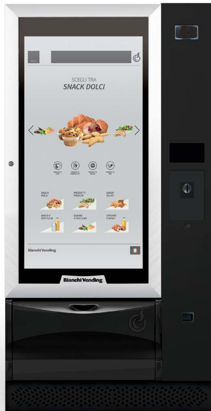
VISTA L MASTER TOUCH 46"

A top range with innovative technologies to provide flexibility and high level of service.