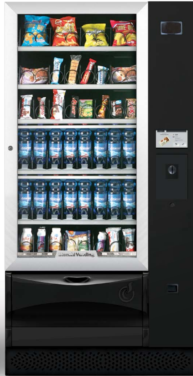
VISTA L MASTER TOUCH 7"